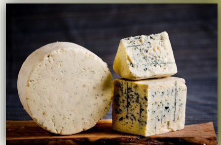
BIG WOODS BLUE