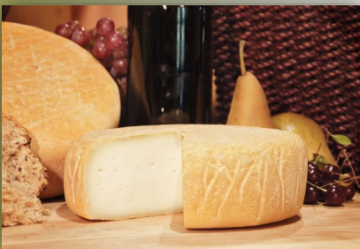
CABRA LA MANCHA