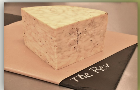
"THE REV" RESERVE